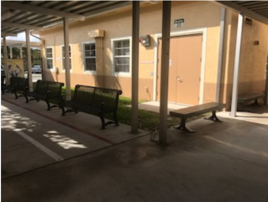
Benches in front of the 2 story building